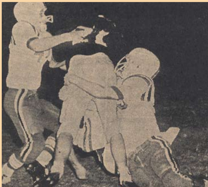
"I 'wanna' hold your hand!" shouts what's his face (?), No. 21, of No Gotta U, as he garciously judo chops two members of the opposing team.

effort. The team support at the games has been very good but not up to the highest level that it could be. It is true that our "home" games are clear over at Chaffey and that it is difficult for some people to get there, but if the team that plays football for you out there on the field is out every day after school practicing