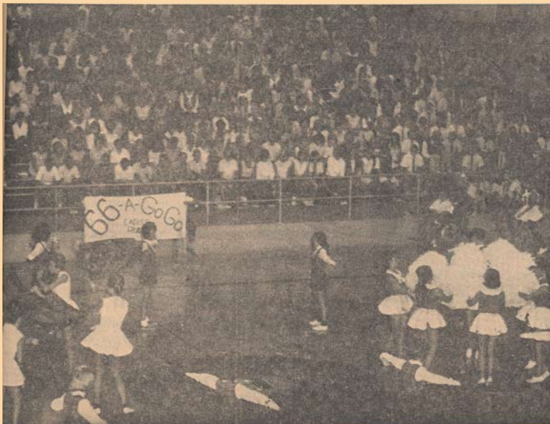
Pom Poms pom; Flag Twirlers twirl, and the Drill Team drills all together during last week's pep assembly for the San Gorgonio game.

The gentle roll of the sea, in the sun, The sparkling foam as the waves lap onto the shore, And no one need tell you of winter in the air. The quiet breeze bringing to water's edge the lonely call of the gulls, The new-born beach basking in the warmth of the once hidden sun, All of this and more is summer on the beach. Multi-colored creatures crawling, creeping, peeping from winter hideouts, The crisp, salty air so sharp you dare not inhale, The intense blue of the sky reflected in the mirror of the surf Glassy waves gaining in strength with each deep green swell, As the glories of spring arise from darkness. Tan-faded figures watching, only watching their sea with anticipation No man is half so alive as the sea. As fall rolls suddenly into winter. With every changing tide, a mood is revealed; A deserted beach, soggy with the slush of water-drenched sand, No attempt is made to hide its thoughts from others. Grey clouds and lightning filling the once peaceful sky, Unpredictable as it may be, the sea is always there, Monstrous breakers pounding where we once lay soaking Ready to accept friend or foe Into its restless bosom.