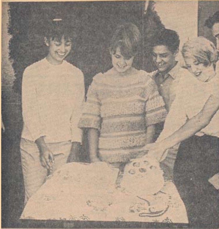
Sophomores heroically restrain their appetites for the sake of the picture of the Sophomore Bake Sale.